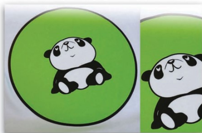
Heat Transfer printing